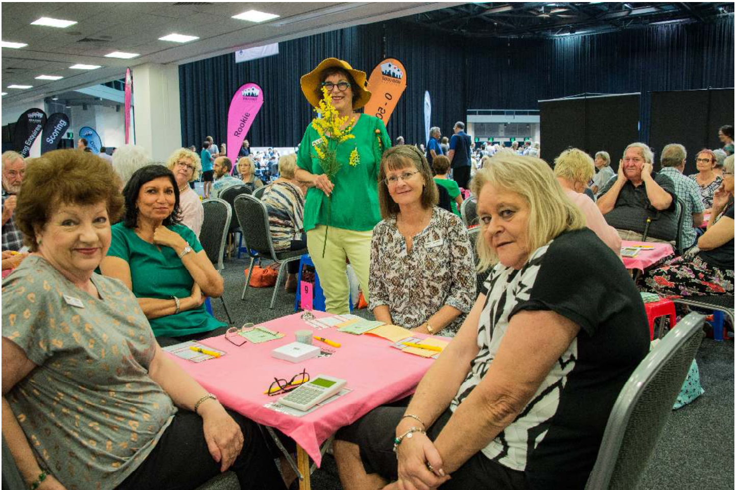
As She Does Every Year, These Getting In The Mood For Theme Day