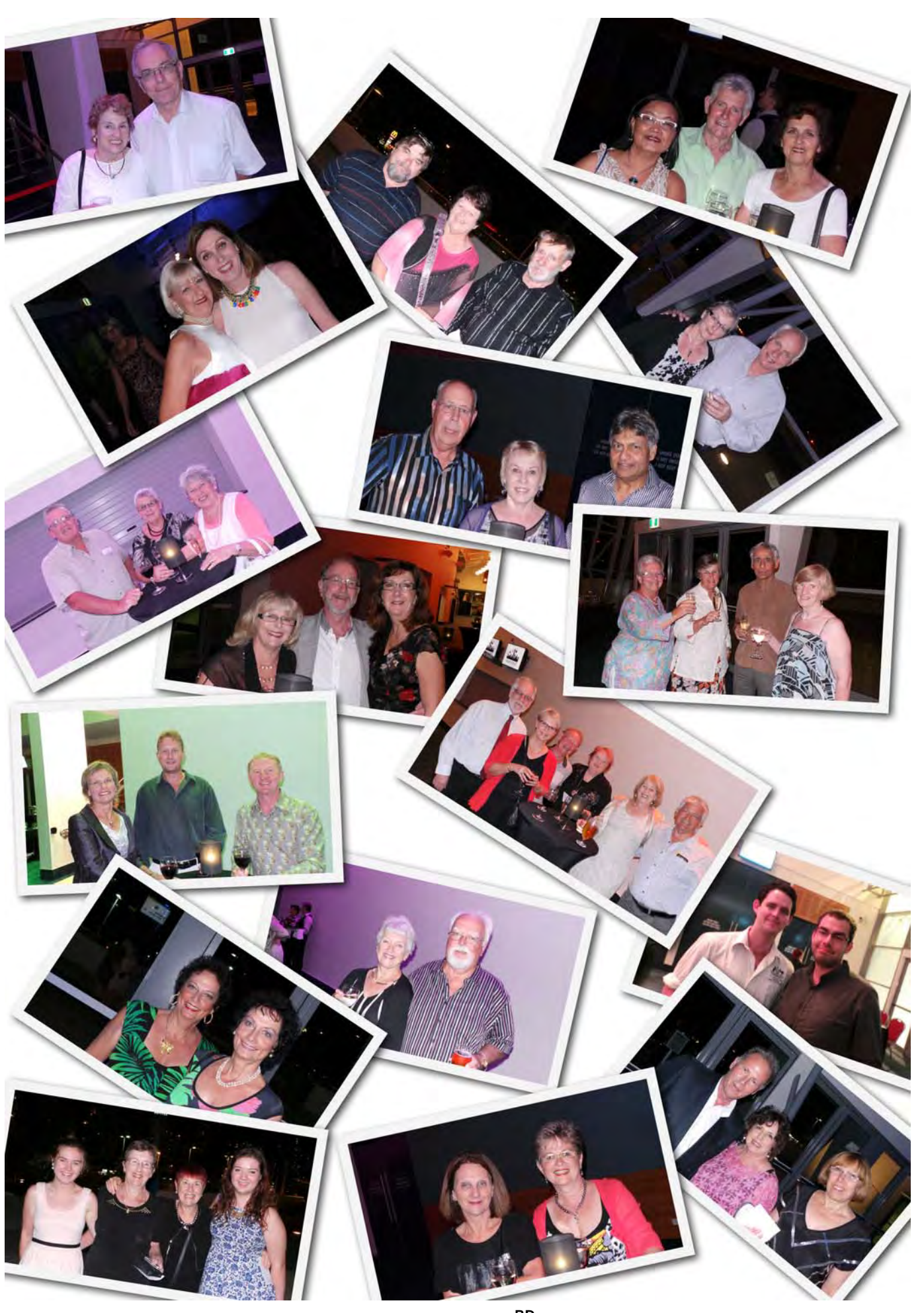
AND SO WE SAY FAREWELL TO THE 53<sup>RD</sup> GOLD COAST CONGRESS WE LOOK FORWARD TO SEEING YOU ALL BACK NEXT YEAR FOR OUR 54<sup>TH</sup> CELEBRATION OF BRIDGE, SUN, FUN, HOLIDAY AND ENJOYMENT